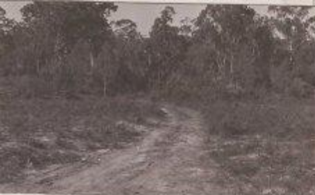
Entrance across motorkhana grounds to Ghost Gum Crescent.

Needs a bit of clear- ing be- fore I can use my NEW slicks