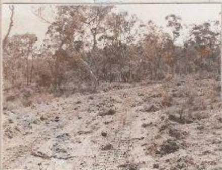
Dirt Circuit -- top ↗ ↖ bottom straight.

9/10th June saw a large crowd of new and old club members helping at the Colo Working Bee