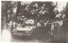
DAVID KELLY (CAR 1) ABOUT TO GO START LAP 1 AT OUR FIRST LAP DASH